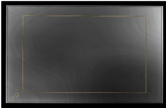
Mura and defect identification

Westboro Photonics offers lens choices with fields of view ranging from 10 to 82 degrees. See the Smart Series USB3 CMOS Photometer datasheet for details.